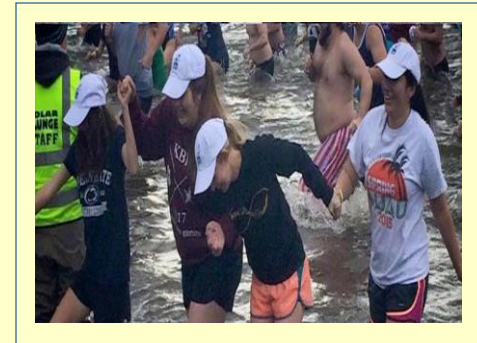
Psi Chapter participating in Polar Plunge 2016 to help raise funds for Special Olympics.